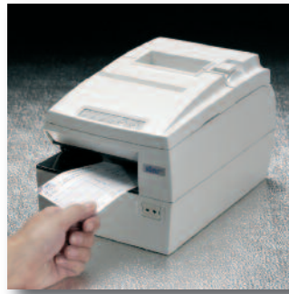
Top or Bottom MICR