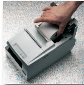
Easy Paper Loading